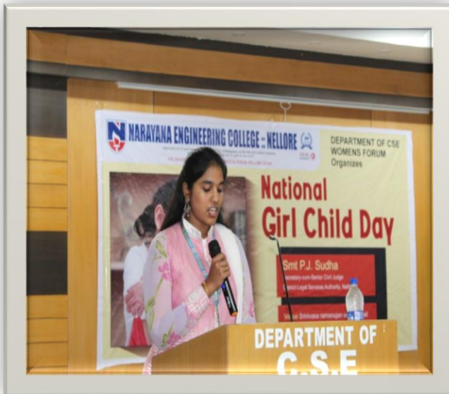
Welcome speech by the student