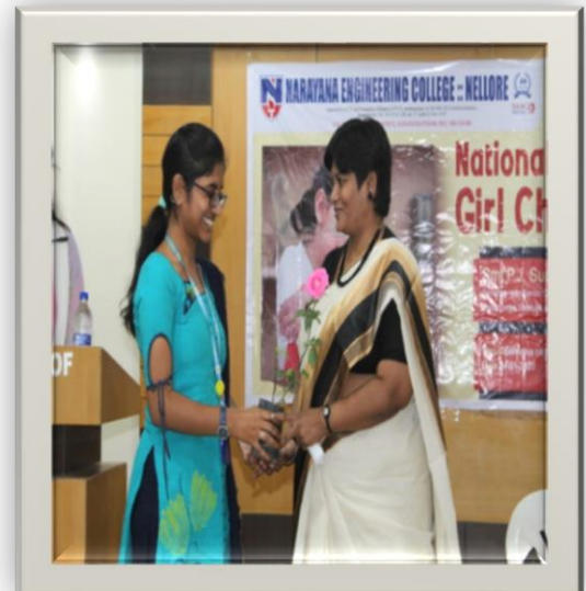
Inviting -guest -on-a -stage