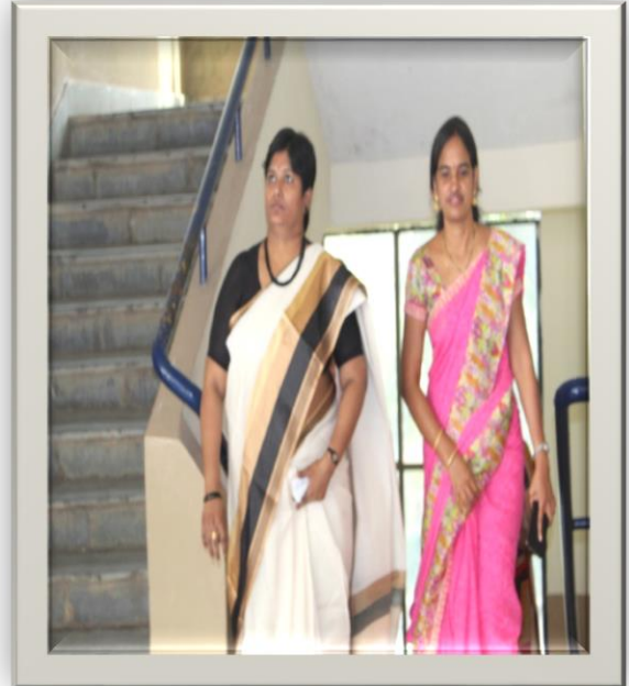
Welcoming resource person by CSE staff